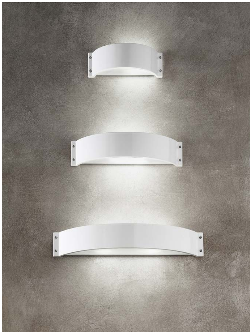
Art. GLA.1 Art. GLA.2 Art. GLA.3